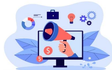
CAUSE RELATED MARKETING